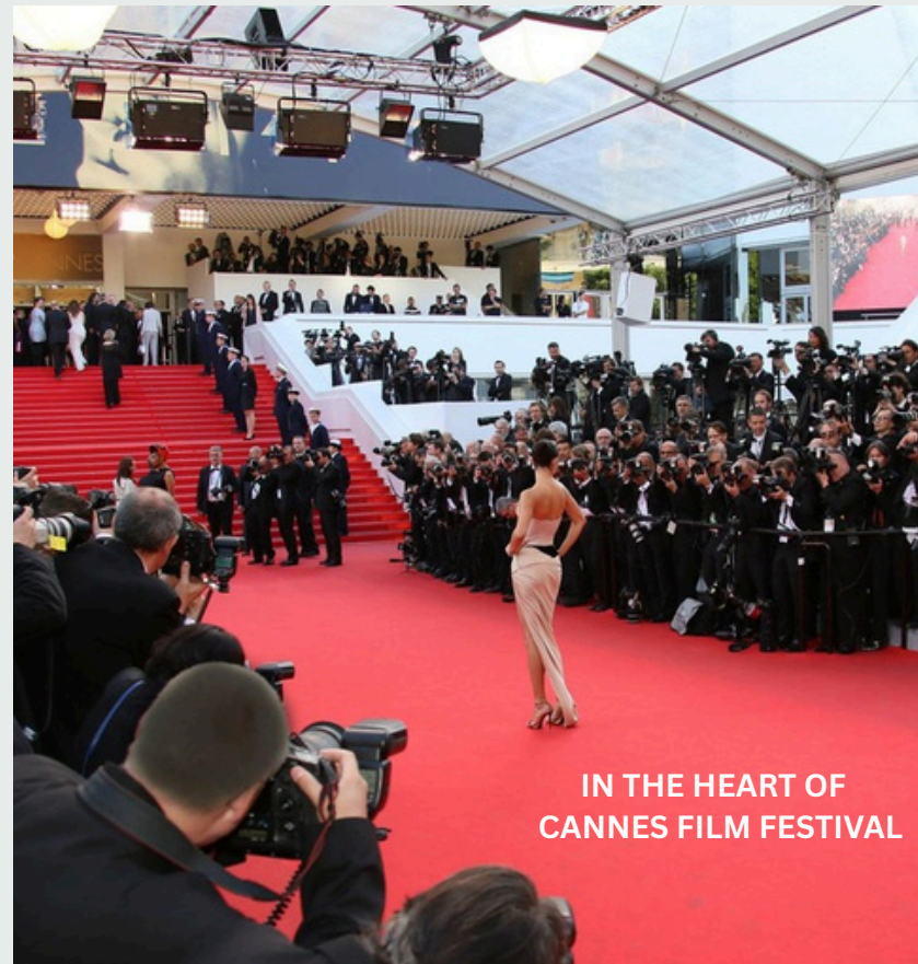
IN THE HEART OF CANNES FILM FESTIVAL